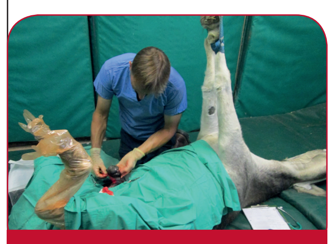
A DONKEY ANAESTHETISED FOR SURGERY

Castration of donkeys requires special care because donkeys have a larger blood supply to the testicles compared with horses and as such are at greater risk of bleeding post-surgery.