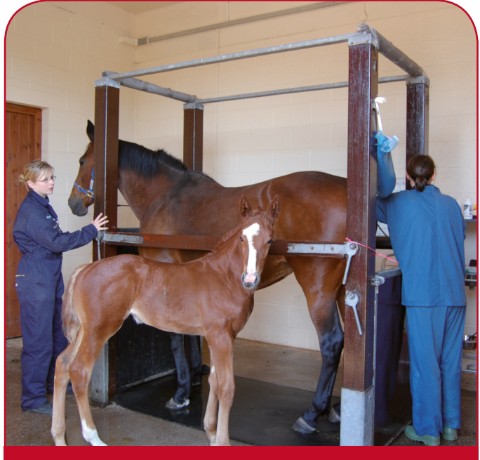
ULTRASOUND EXAMINATION OF THE UTERUS