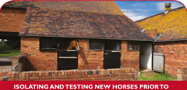
ISOLATING AND TESTING NEW HORSES PRIOR TO INTRODUCTION ONTO THE YARD HELPS LIMIT THE SPREAD OF CONTAGIOUS AND EXOTIC DISEASE