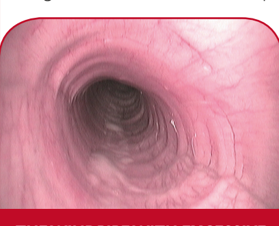
THE WINDPIPE WITH EXCESSIVE MUCUS AND PUS SITTING IN A POOL, INDICATIVE OF RAO

This condition, formerly called COPD results in large amounts of mucus and pus within the small