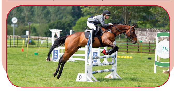
For further information contact your local XLEquine practice: