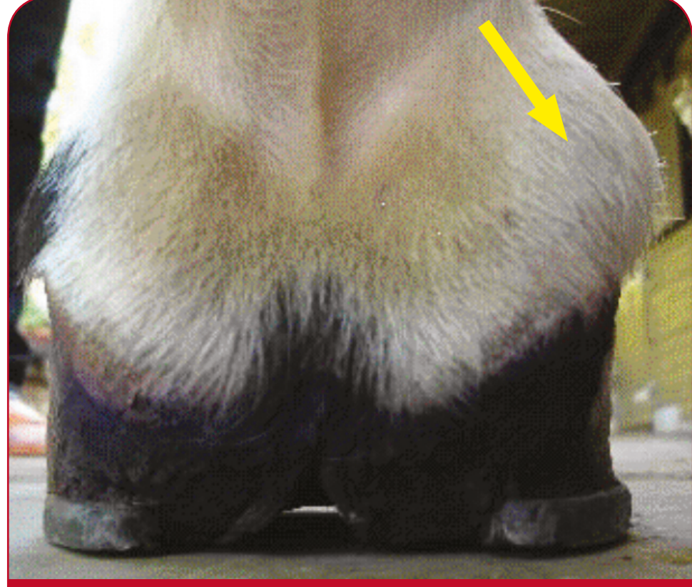
FIGURE 2: SIDEBONE CAN BE FELT ABOVE THE CORONARY BAND AND QUARTERS OF THE HOOF. THIS HORSE HAS AN ENLARGED RIGHT SIDE ASSOCIATED WITH SIDEBONE FORMATION

When lameness occurs as a consequence of sidebone formation, it is because the rigid structure is pressing on the