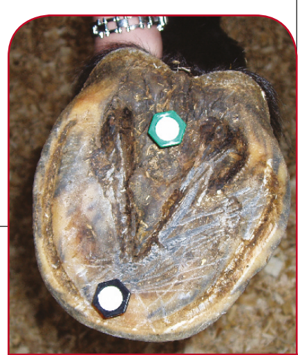
FIGURE 2: WOUNDS OVER THE FROG (GREEN PIN) CARRY A HIGH RISK OF JOINT PENETRATION, WHEREAS WOUNDS CLOSE TO THE TOE (BLACK PIN) ARE LESS LIKELY TO HAVE SERIOUS CONSEQUENCES