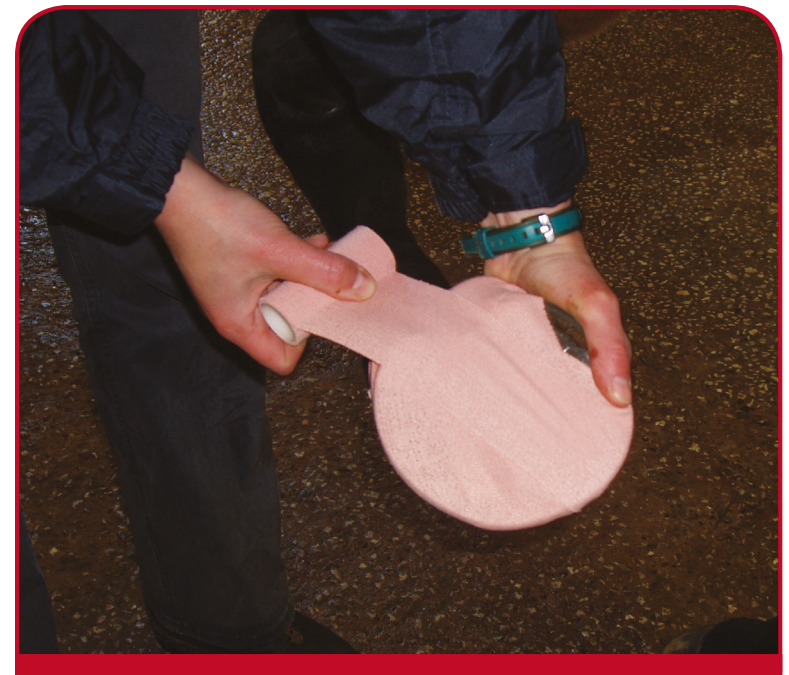
FIGURE 5: POULTICE APPLICATION

If the foreign body e.g. nail is still in place, do not remove it. Secure some padding around it to prevent it moving or being driven deeper into the foot. If the vet suspects a deep penetration an x-ray will be taken. A metal foreign body provides an excellent marker on the x-ray, showing which structures of the foot are involved (figure 4). If the nail is removed, diagnosis is much more difficult.