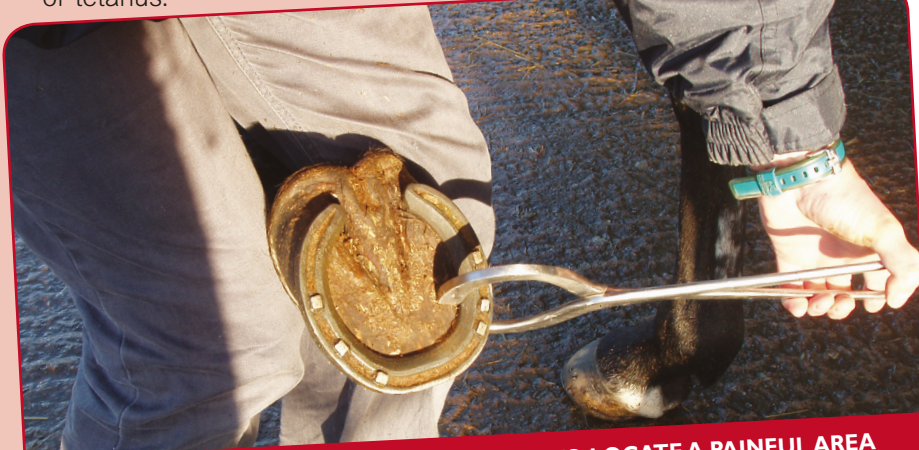
FIGURE 3: FOOT TESTERS MAY HELP TO LOCATE A PAINFUL AREA

FIGURE 2: WOUNDS OVER THE FROG (GREEN PIN) CARRY A HIGH RISK OF JOINT PENETRATION, WHEREAS WOUNDS CLOSE TO THE TOE (BLACK PIN) ARE LESS LIKELY TO HAVE SERIOUS CONSEQUENCES